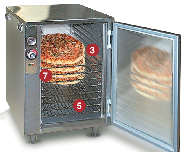
HLC-1717-13 Shown with optional Stainless Steel Door