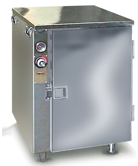
HLC-1717-11-UC Shown with optional Legs and Paddle Latch