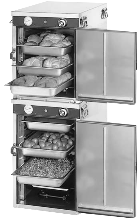
HLC-5S stacked on an HLC-8S with stacking angles

There's no limit to the versatility of these handy stackable cabinets - natural radiant heat helps food taste their best!