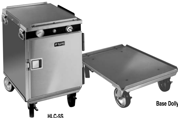
HLC-5S Shown with stacking angles and base dolly.