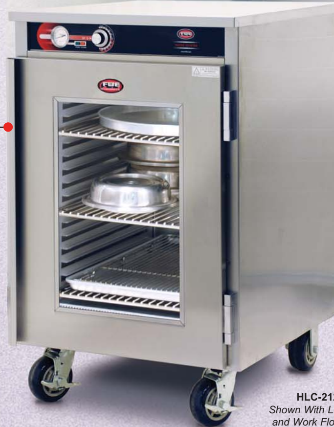
HLC-2127-9 Shown With Lexan Door and Work Flow Handle Optional Accessories