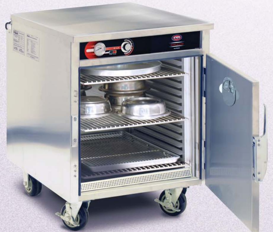
HLC-2127-6 Shown With Door Vent Optional Accessory