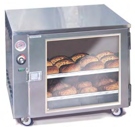
HLC-SL1826-5L Shown with Lexan Door and larger casters optional accessories.

Keep foods oven fresh longer and prevent product dehydration and shrinkage.