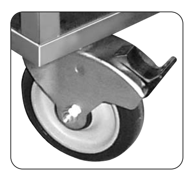
"Total Lock" simultaneously locks the swivel and wheel making the unit stationary.

Versatile mobile work station in durable all stainless steel -Use for preparation and processing operations or machine stand.