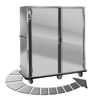
E-Z Turn 6-Caster Configuration