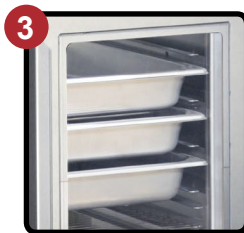
Fixed Rack Assembly