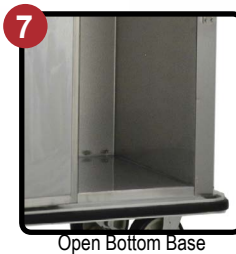
Open Bottom Base