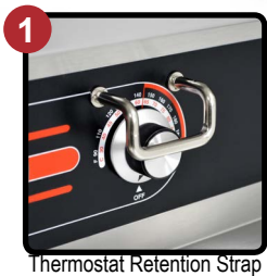
Thermostat Retention Strap