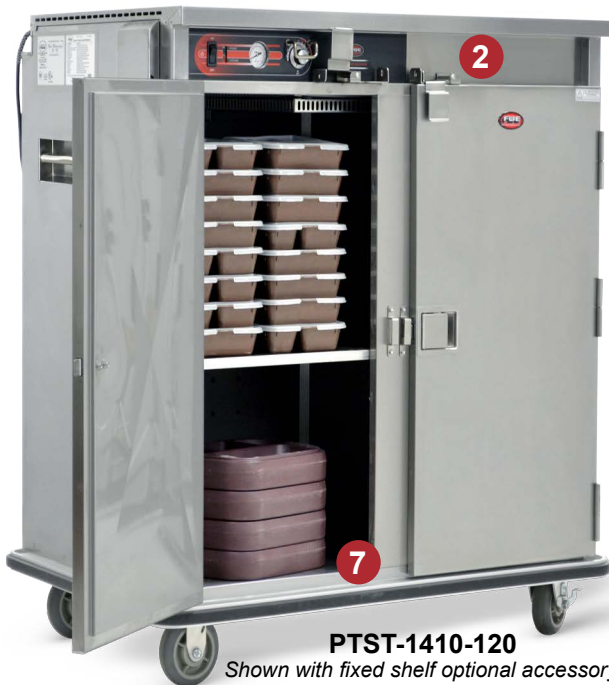
PTST-1410-120 Shown with fixed shelf optional accessory.