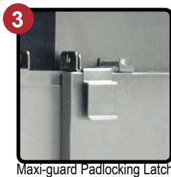
Maxi-guard Padlocking Latch