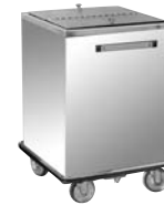
ICE STORAGE CART SIC-222

FWE Products are used by major companies world-wide. We can modify, design, or custom build equipment to fit your special requirements.