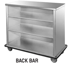
BACK BAR SPSC-44

Holds 200 lbs. of ice! Fully insulated. Flip-top stainless lid. Drain, push bar handle, and all swivel 5" casters. Welded steel frame.