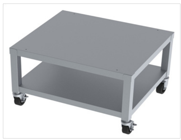
HEMST-36 (shown with optional casters)