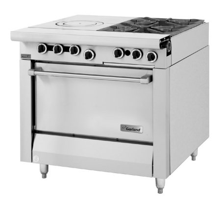
Model MST54R (valve control panel not as depicted)