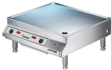
208V models with adjustable stainless steel legs