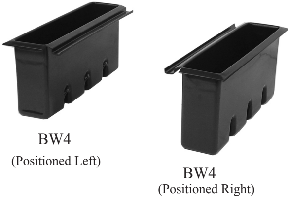
BW4 (Positioned Left)