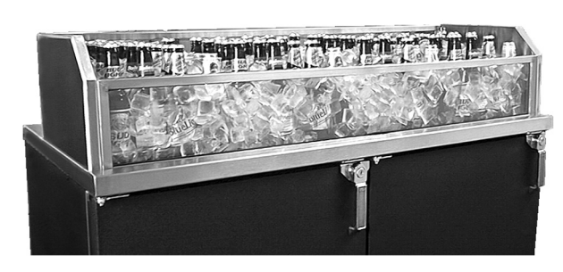
GDU-16x48 Factory mounted on cooler cabinet