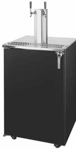
KC24-NC-BS2(L) Shown with optional 2-faucet column tower for use with 1/6 barrel mini kegs*

Conforms to ANSI/UL STD 471 Certified to CSA STD C22.2 No. 120