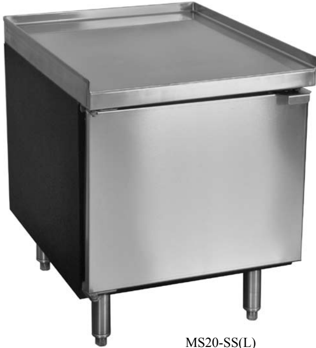
MS20-SS(L) with CLS-4 leg set accessory