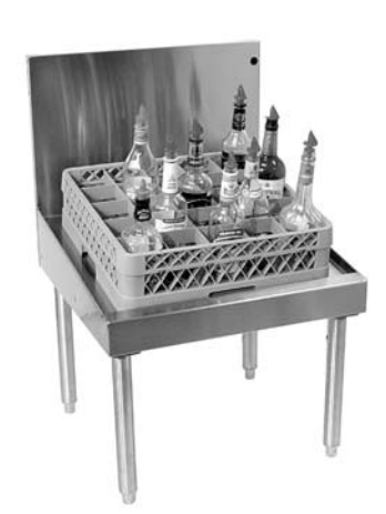
SLD-24 (Liquor bottle rack not included)