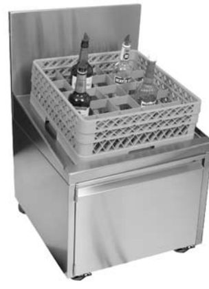
SLDC-24 (Liquor bottle rack not included)