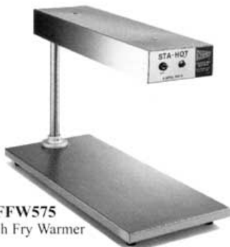
FFW575 French Fry Warmer

When customers come to your store or restaurant, two things are certain: they want their food hot and they want it to taste fresh.