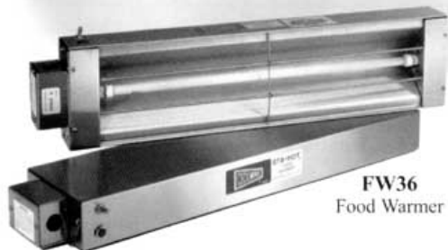
FW36 Food Warmer