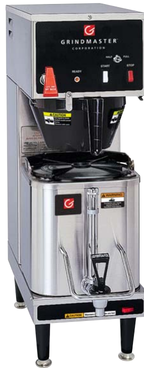
Model P200 Shuttle® Brewer