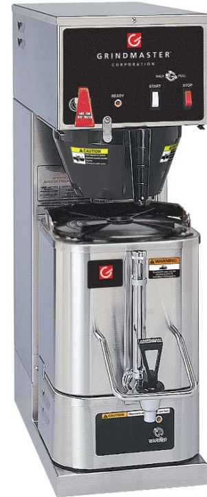
Model RAPS200 Shuttle®/Airpot Brewer

The P200 Shuttle® Brewer consistently delivers perfect coffee. Grindmaster's exclusive air gap insulated Shuttle® maintains the freshness and taste that your customers expect and allows you to transport and serve your coffee safely and easily.