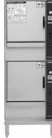
Model (2)SSB-5EF shown

ating reservoir to provide atmospheric steam to the cavity at a temperature of approximately 212° F. The high-efficiency steam generating reservoirs shall have water level sensors. Electric heating elements shall not be immersed in water (dry) and replaceable from the rear.