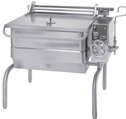
Model BPM-40G shown

A heavy-gauge, fully-adjustable one-piece cover is standard with torsion bar type counterbalance designed to maintain the selected cover position. A vent is provided in the cover top to regulate condensate buildup and a rear condensate drip shield is located under the cover to prevent condensate from dripping on floor when cover is opened.