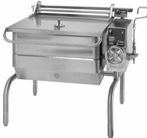
Model BPM-40G shown

A heavy-gauge, fully-adjustable one-piece cover is standard with torsion bar type counterbalance designed to maintain the selected cover position. A vent is provided in the cover top to regulate condensate buildup and a rear condensate drip shield is located under the cover to prevent condensate from dripping on floor when cover is opened.