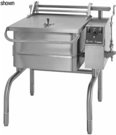
Model BPP-30E shown

A heavy-gauge, fully adjustable one-piece cover is standard with torsion bar type counterbalance designed to maintain selected cover position. A vent is provided in the cover top to regulate condensate buildup and a rear condensate drip shield is located under the cover to prevent condensate from dripping on floor when cover is opened.