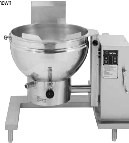
Model DHS shown

heat indicator light are mounted on the kettle support side console. Gas supply shall shut off automatically when unit is tilted.