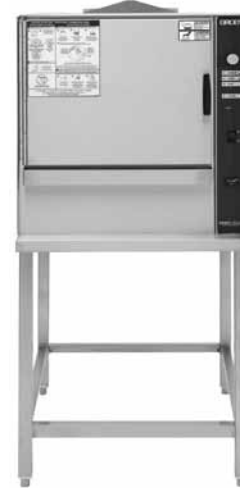
Model SSB-10GF shown

steam generating reservoir shall have water sensors. Gas heater shall have infrared burners with a firing rate of 100,000 BTU/hr.