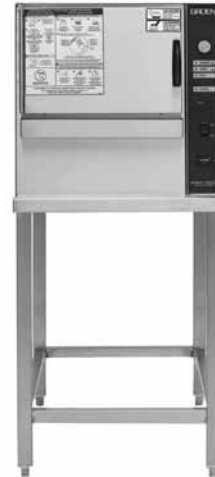
Model SSB-3EF shown

temperature of approximately 212° F. The high-efficiency steam generating reservoir shall have water level sensors. Gas heater shall have infrared burners with a firing rate of 54,000 BTU/hr.