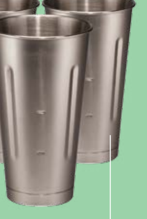
Includes Three Stainless Steel Cups model 110E

Cup Guide activates motor when mixing cup is inserted; stops when cup is removed