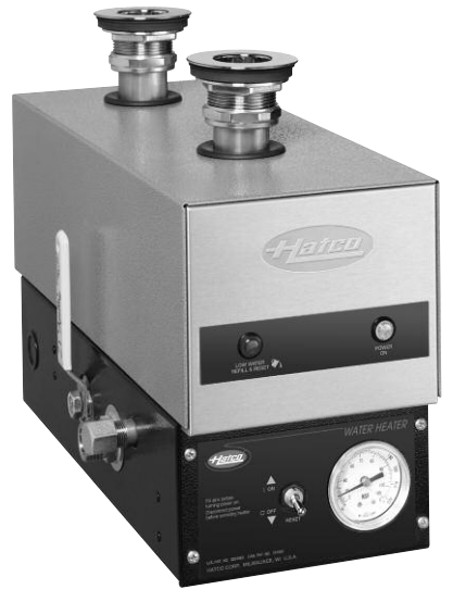
3CS-6 with optional temperature monitor