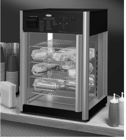
Model FDWD-2X with stationary 4-shelf multi-purpose rack