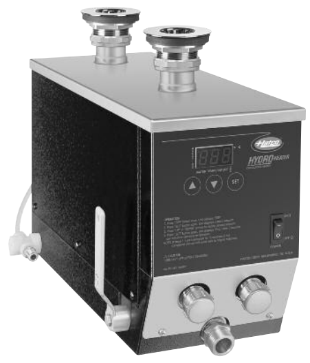
Model FR2-3 Patented