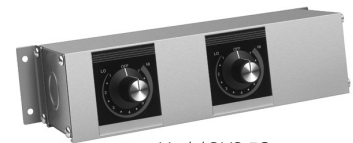
Model RMB-7C with infinite controls