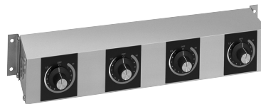
Model RMB-14D with infinite controls