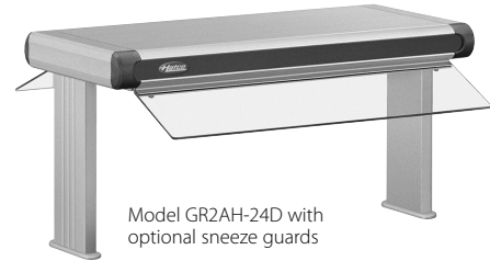
Model GR2AH-24D with optional sneeze guards