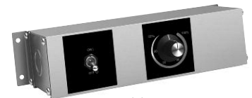
Model RMB-7L with one toggle and one infinite