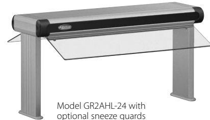
Model GR2AHL-24 with optional sneeze guards