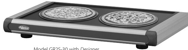
Model GR2S-30 with Designer color inset panels and accessory food pans