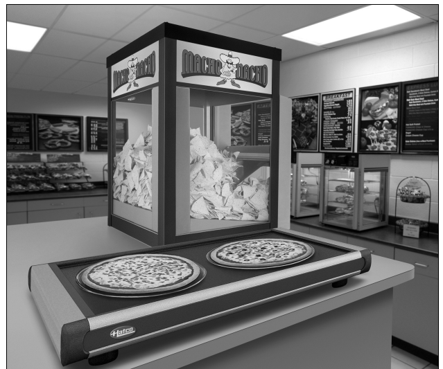
GR2S-36 with Designer color inset panels and accessory food pans