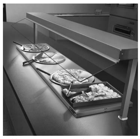
Model GRAHL-66 over a GRS-60-I with optional sneeze guards and accessory non-adjustable tubular stands