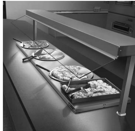
Model GRAHL-66 over a GRS-60-I with optional sneeze guards and accessory non-adjustable tubular stands