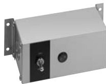
Model RMB-3F with toggle switch and indicator light