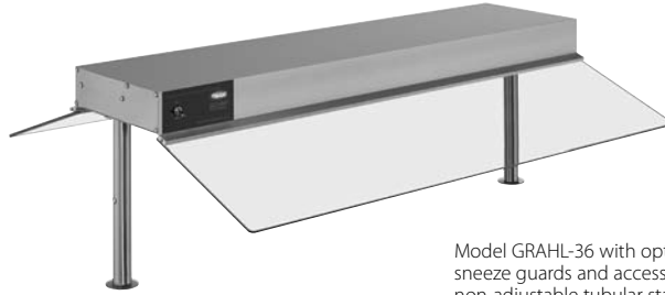
Model GRAHL-36 with optional sneeze guards and accessory non-adjustable tubular stands