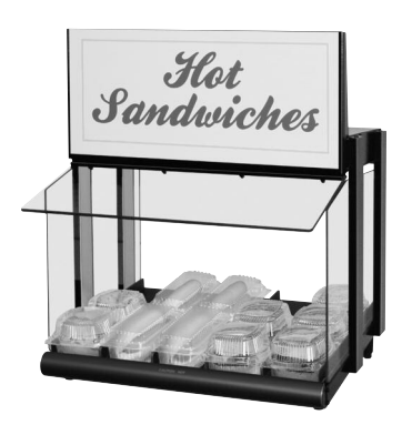
Model GRHW-1SGS with breath protector, accessory sign holder (graphic not included), five hardcoated bins, and optional Designer color