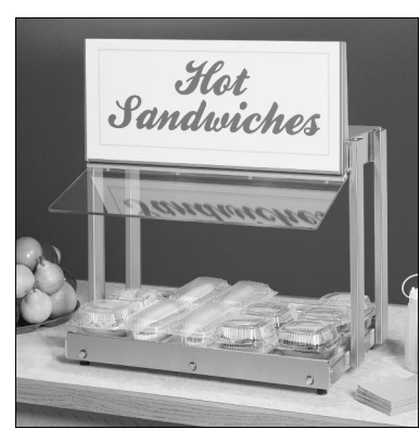
Model GRHW-1SG with accessory sign holder (graphic not included)