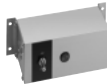
Model RMB-3F with toggle switch and indicator light