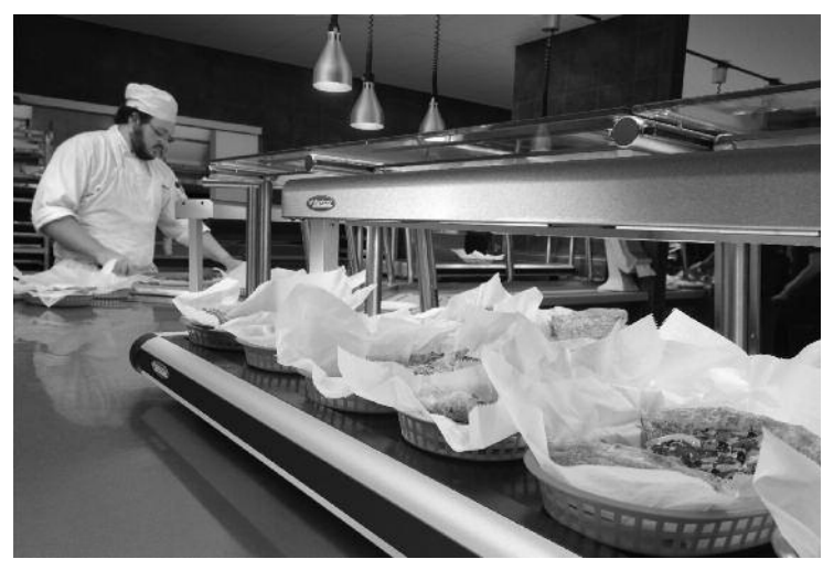
Model GRN4L-48 in Stainless Steel over Glo-Ray Portable Heated Shelf Model GR2S-36