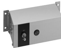
Model RMB-3F with toggle switch and indicator light