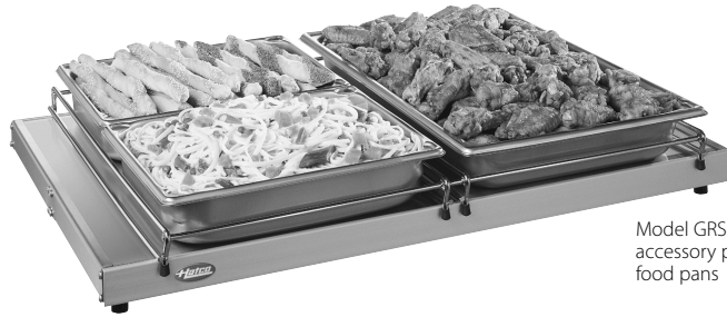
Model GRS-30-I with accessory pan rail and food pans