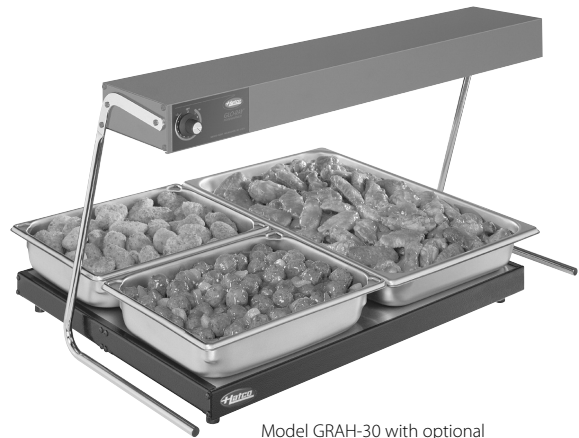
Model GRAH-30 with optional Designer color and infinite switch and accessory C-Leg stand over Heated Shelf model GRS-24-I in optional Designer color

BLANKET ELEMENTS GUARANTEED AGAINST BURNOUT AND BREAKAGE FOR ONE YEAR.