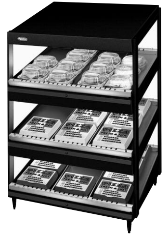
Model GRSDS-24T triple slant shelf in optional Designer black