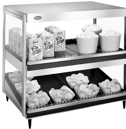
Model GRSDS/H-36D with slant base and horizontal top shelf and optional 15" (381 mm) clearance top shelf