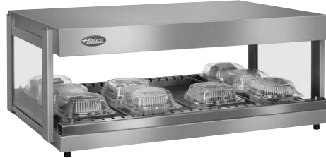
Model GRSDH-30 horizontal single shelf

Equipment On Signage Program Hatcographics.com