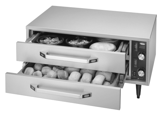
Model HDW-1R2 Shown with optional no vent drawer.