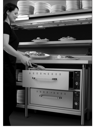
Model HDW-2 with optional stainless steel legs