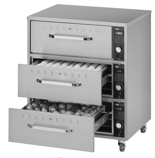
Model HDW-3 with optional casters