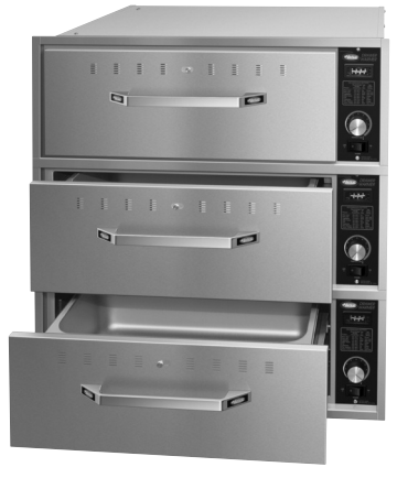
Model HDW-3B built-in