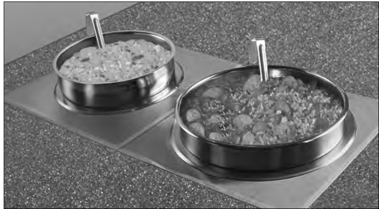
HWB-7 and 11QTD with accessory food pans (notched lid not shown)