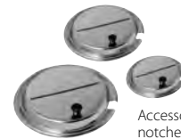
Accessory hinged and notched lid for 4, 7, or 11 Quart round pans.