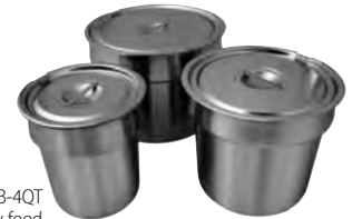
Model HWB-4QT with accessory food pan and notched lid