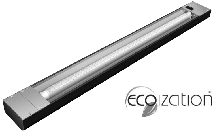
Model NLL-30 in Designer Black (standard)