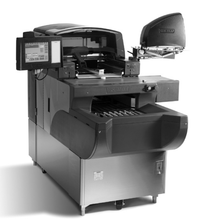
Fully Automatic AWS