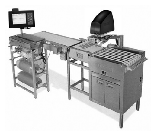
Semi-Automatic CLA System