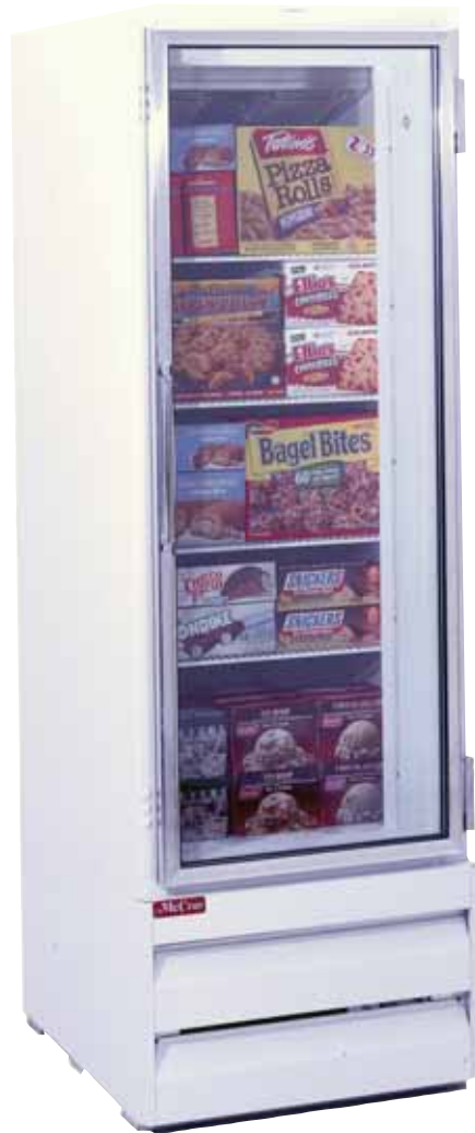
Shown is a bottom mount freezer