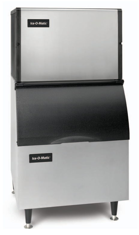
CE0250 ON B40