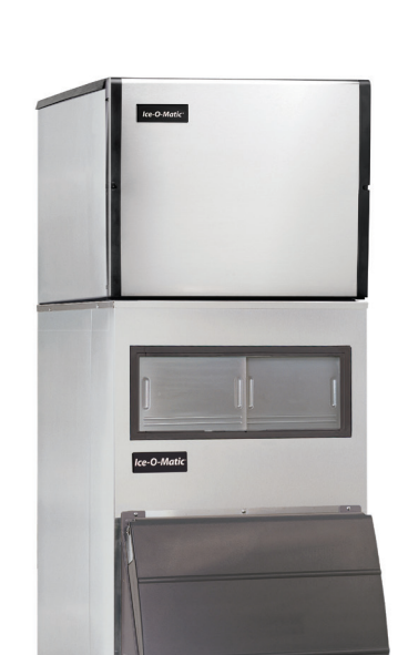
ICE0856 ON B700-30