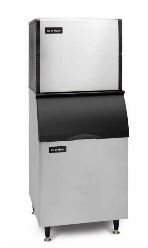
ICE1006 ON B55